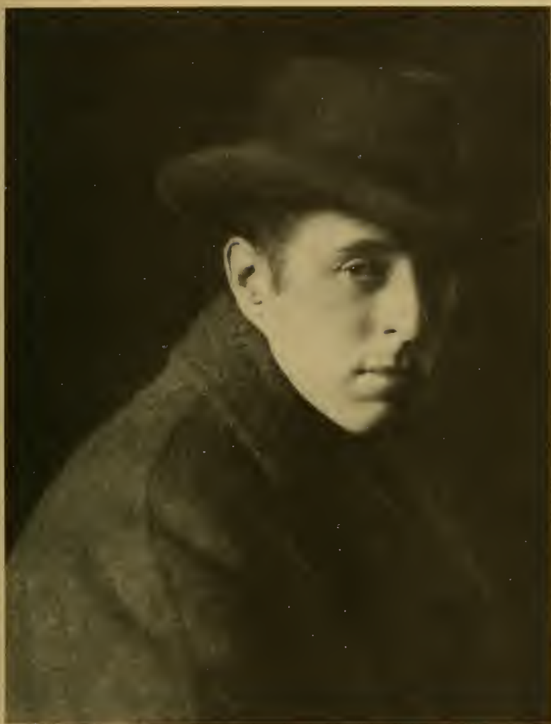
DAVID WARK GRIFFITH